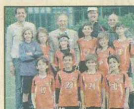
Mayor Jimmy Delshad heads out to the soccer field. 21