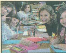
Horace Mann hosts kids and families for literacy night. 5