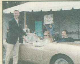
Hundreds turn out for Greystone Concourse. 20