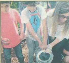
El Rodeo plants green, edible garden. 4