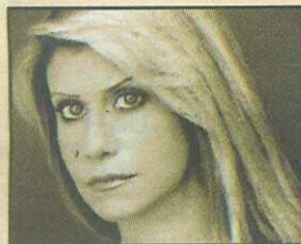
BH Alumna to be first female announcer of the draft pick. 5